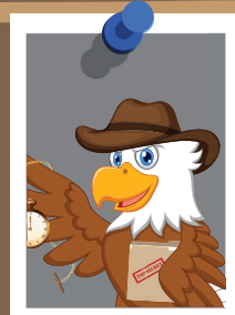
Patrick the eagle