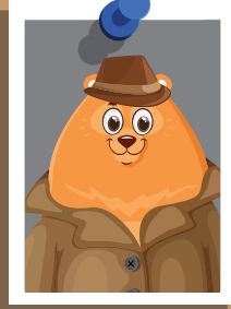
Pudge the bear