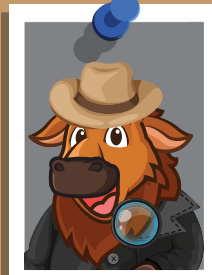
Brutus the bison