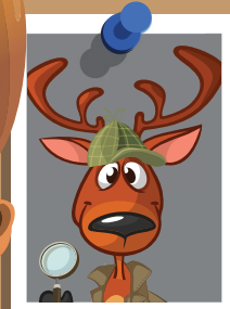
Hugo the deer