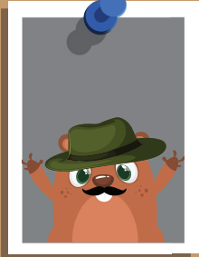
Gus the groundhog