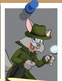
Scooter the coyote