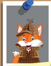
Fresno the fox