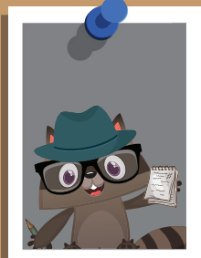
Rascal the raccoon