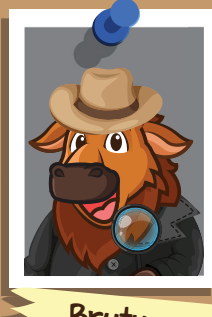
Brutus the bison