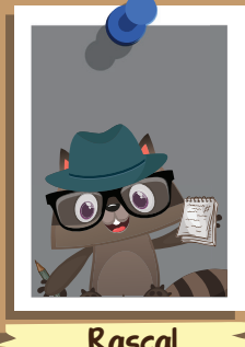
Rascal the raccoon