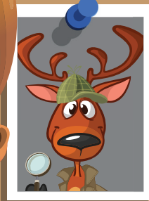
Hugo the deer