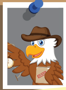
Patrick the eagle