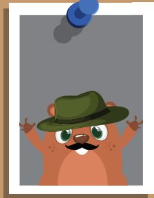
Gus the groundhog