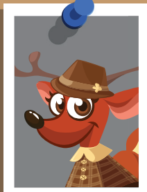
Henrietta the deer