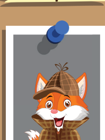
Fresno the fox