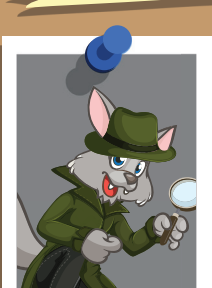
Scooter the coyote